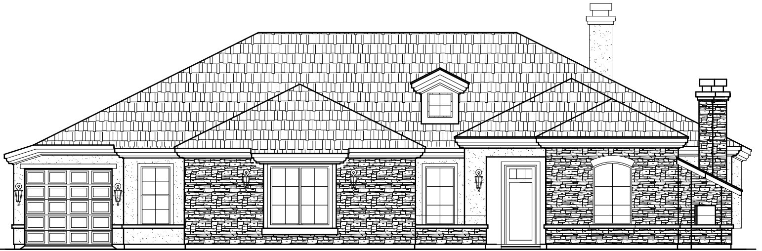
SCOTTY - ELEVATION B