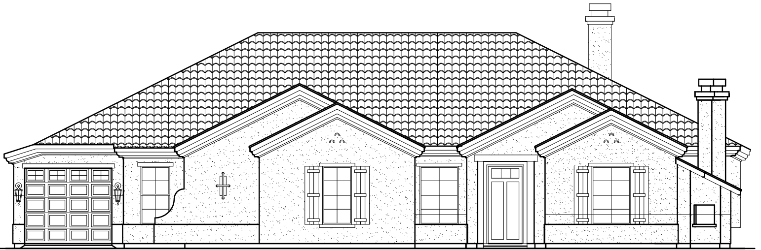
SCOTTY ELEVATION A